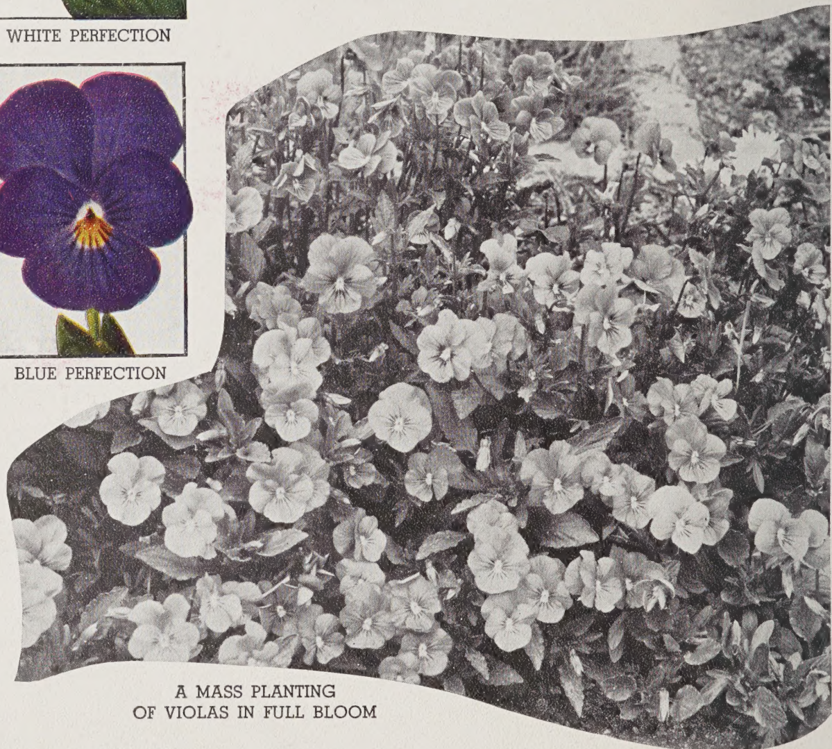
A MASS PLANTING OF VIOLAS IN FULL BLOOM

ANY OF THE ABOVE: 25 for 75c, $2.40 per 100, $18.00 per 1000 250 plants of one variety at the 1000 rate